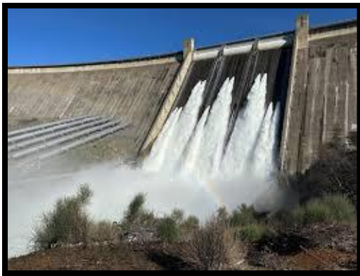
February 2025 release following the winter storm

Shasta Lake water level (daily): 1028.57 feet elevation Full lake is 1067 feet elevation above sea level