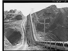
conveyor belt 9.5 miles long with 16,000 rollers

24 hour change in elevation: down 0.06 feet