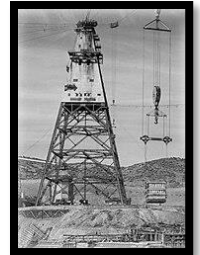
The main 465-foot tower used to support the cableway system at the dam site