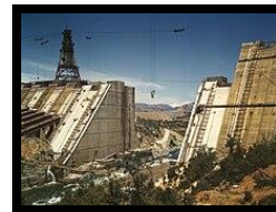
Construction of the spill way June 1942