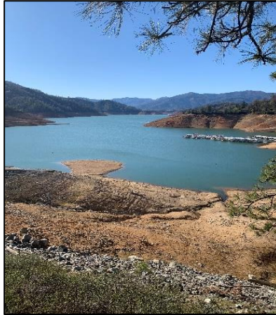
Shasta Lake 2/23/22

On Feb. 23, 2022, the Bureau of Reclamation announced initial 2022 water supply allocations for Central Valley Project contractors. Allocations are based on an estimate of water available for delivery to CVP water users and reflect current reservoir storages, precipitation, and snowpack in the Central Valley and Sierra Nevada. This year's low allocations are an indicator of the third consecutive dry year California is experiencing and will be updated if conditions warrant.