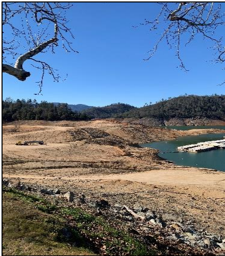
Shasta Lake 2/23/22

Currently, CVP reservoir storage is below the historic average for this time of year and runoff forecasts predict that overall storage will be limited if substantial spring precipitation does not materialize.